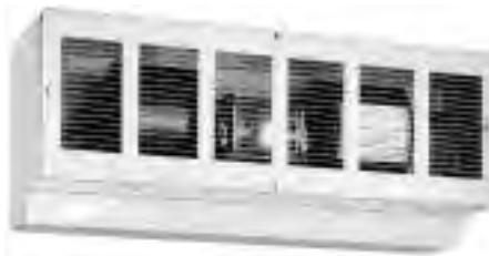
24" Unit (Grill Only)