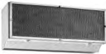
24" Unit (Filter Only)