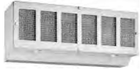
24" Unit (Filter and Grill)