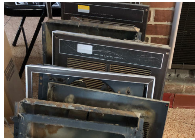
Building's Original Wall Heaters (Prone to poor/unsafe air quality)