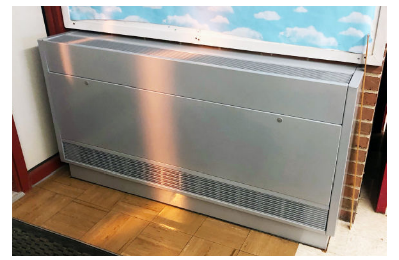
Marley CUH Cabinet Unit Heater (Replaced the Original Unit Heaters)

with modern energy efficient heaters, the school is running less units while still maintaining a comfortable environment, and as a result is realizing utility savings. They are also experiencing the air effects of new units and filters, which aid in filtering and eliminating bacteria and other airborne contaminants.