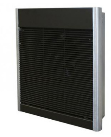
Marley AWH Wall Heater (Replaced the Original Wall Heaters)