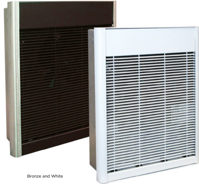
Bronze and White