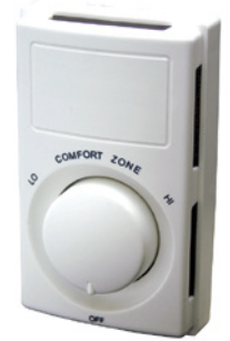
MS26 or M601W