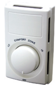
MS26 or M601W