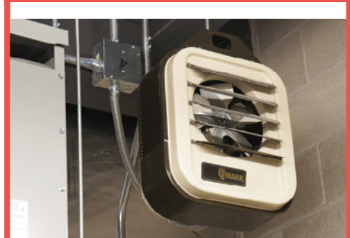
MUH & MUH-PRO